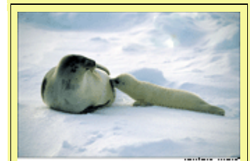
Harp Seal: Nursing Pup