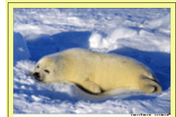
Harp Seal Pup: Sleeping on the Ice

Harp seals are sometimes called saddleback seals because of the dark, saddlelike marking on the back and sides of their light yellow or gray bodies