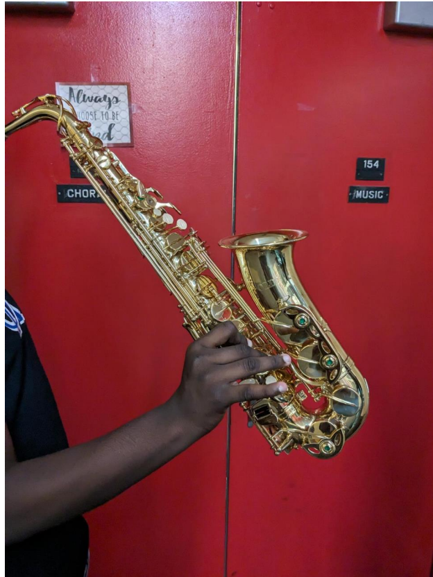
1 - Music has become our new love language.