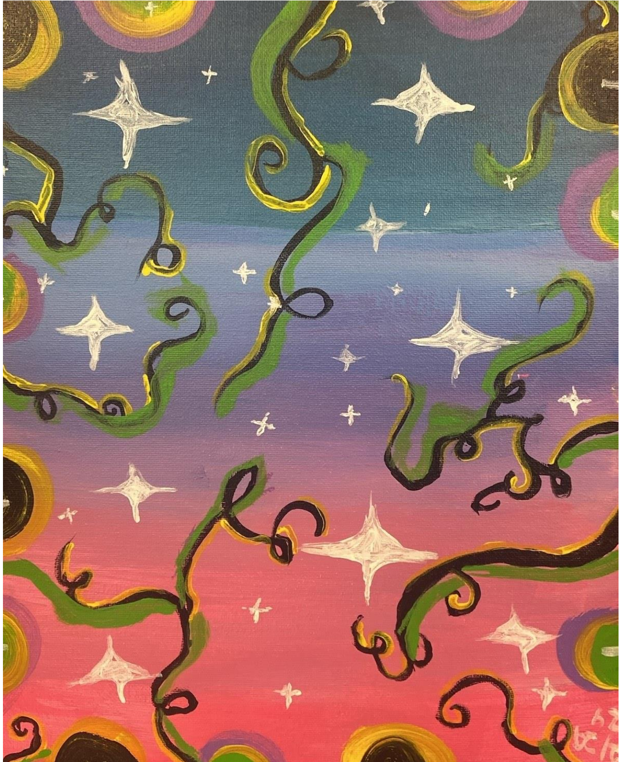
Tangled in the Midnight Sky by Stephaine Glaze